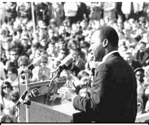
MLK Holiday is January 20, 2014

1) His name was originally Michael, not Martin. His father was also Michael King, hence why Martin Luther King Jr. was originally named Michael King Jr. However, after a trip to Germany in 1931, Michael King Sr. changed his own name in homage to historic German theologian Martin Luther. Michael King Jr. was two years old at the time and King Sr. made the decision to change his son's name to Martin Luther as well.