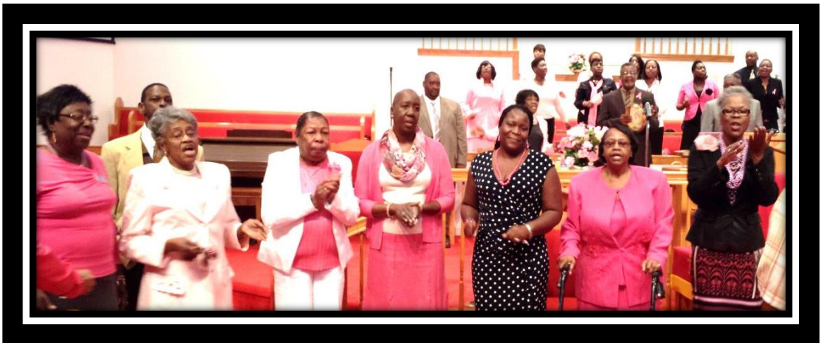
Breast Cancer survivors pictured above were recognized and honored for their fight against Breast Cancer.