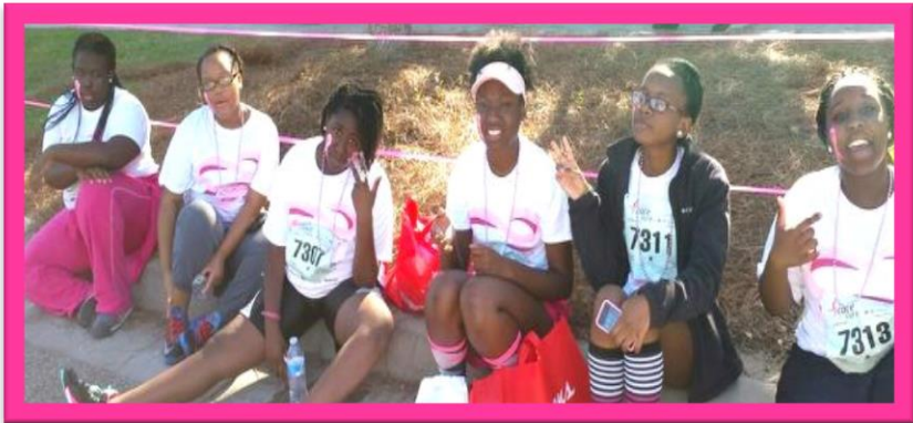
The D.R.E.A.M. Ministry participated in a walk on Daniel Island in honor of Breast Cancer Awareness Month.