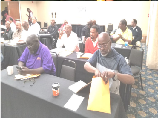
Listening to Preaching & Teaching