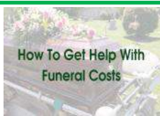
How To Get Help With Funeral Costs