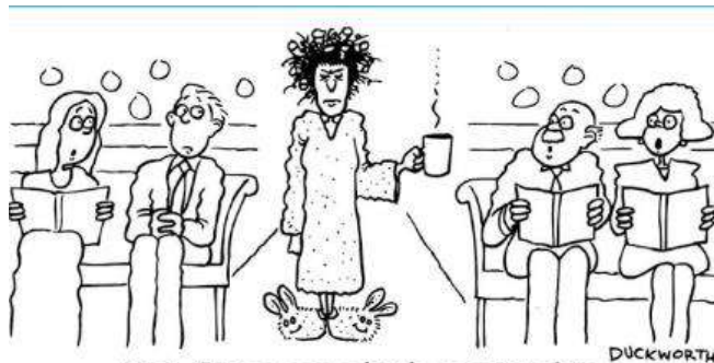
Mrs. Jones got a little too used to watching online worship from home.

What did Daniel tell his real estate agent?